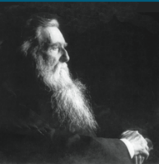
John Ruskin 1819–1900

Summer vacations are not the time for being alert to drug safety matters, not for me at least. I want to read and think about philosophy and sail, and other stuff like that.