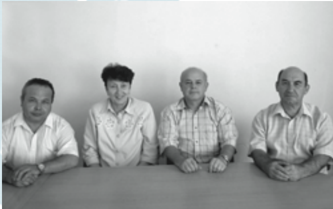
A group working on adverse reactions in the Pharmacological Committee of Republic of Uzbekistan.