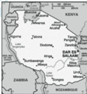
Figure 1: Map of Tanzania

Spontaneous reporting is still very low (table 1) and ADR reports originate from doctors and pharmacists; no reports have come from nurses, consumers and industry (except Adverse Events from clinical trials). Vaccines are authorized by TFDA but monitored by EPI and there is no agreement for ADR monitoring between the two institutions; more collaboration with public health programmes is needed. Zonal DICs need to be reactivated by having a clear agreement between concerned parties regarding their respective responsibilities.