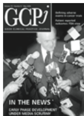
Clinical trials in the news

In order to determine how the above differences are addressed by regulatory authorities, an e-mail was sent out on Vigimed on behalf of the South African medicines regulatory authority in June 2006. This e-mail asked four questions relating to the management and review of ADRs reported from clinical trials involving INDs. Six, very useful responses were received and are summarised in the table below. A review of the procedures for managing clinical trial ADRs suggests that the procedures for handling IND clinical trial ADRs are very different between countries.