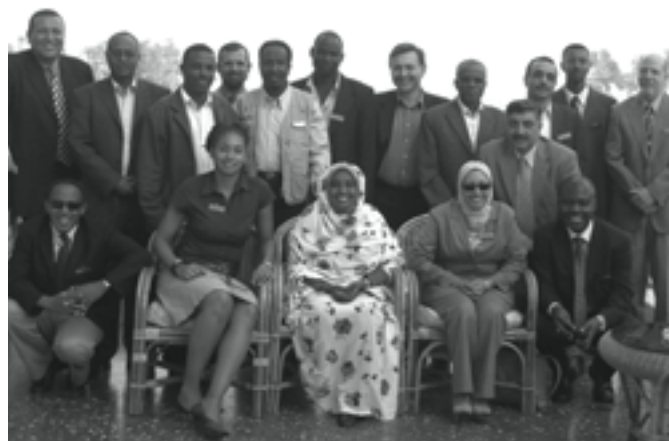
Participants and facilitators at the HANMATT pharmacovigilance workshop.

The Horn of Africa Network for Monitoring Anti-malarial Treatment (HANMATT) held a 5-day pharmacovigilance and quality assurance workshop in Alexandria, Egypt from 16th to 20th September 2006.