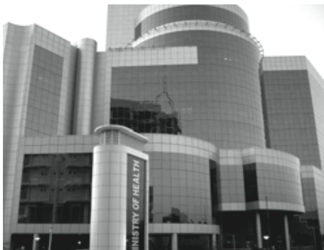
The Ministry of Health building, Gaborone.

The first PowerPoint slide I showed was the flag of Botswana and the group agreed to sing their National Anthem. I didn't understand the words, but they sang beautifully and the anthem was impressive. This seemed to set the tone for the whole course because pharmacovigilance is about helping their people; it is not an academic exercise.