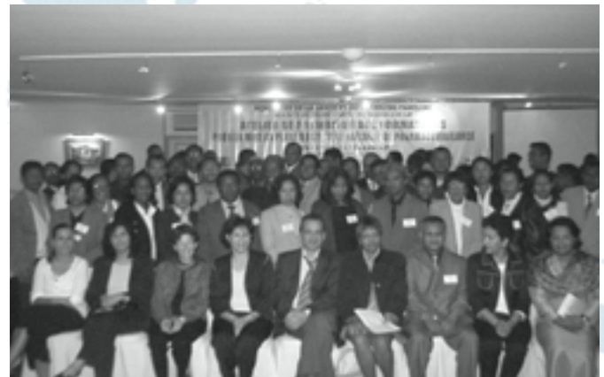
The training group in Antananarivo