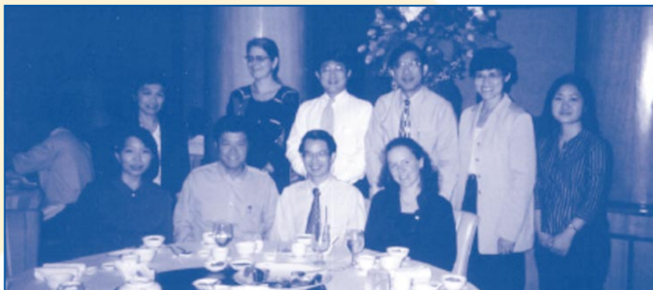
Lunch at Xin Cuisine, Singapore

Reports from the working groups will form the basis of a document from the Government Pharmacy, which will hopefully mean a fresh start for drug monitoring in Fiji.